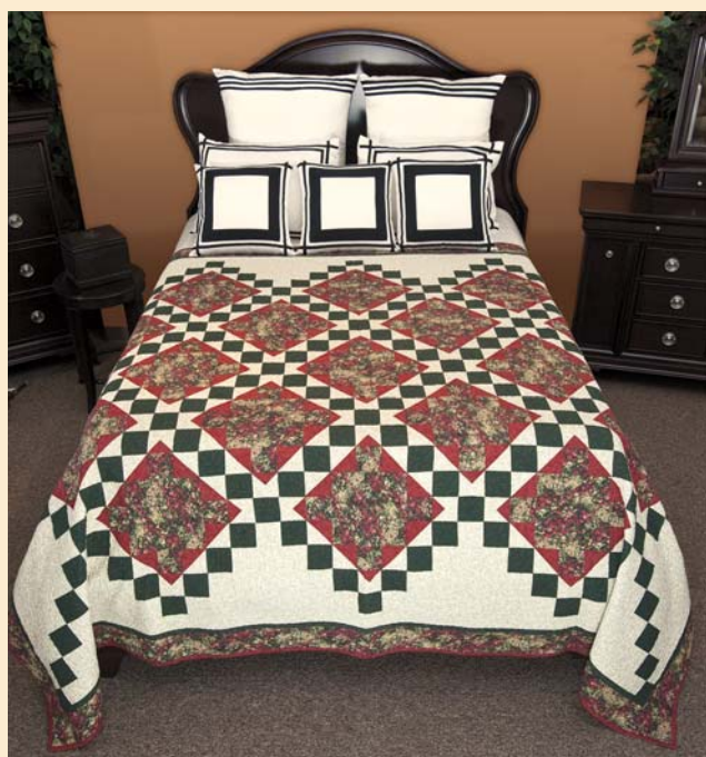
SAWTOOTH PATCHWORK IRISH CHAIN