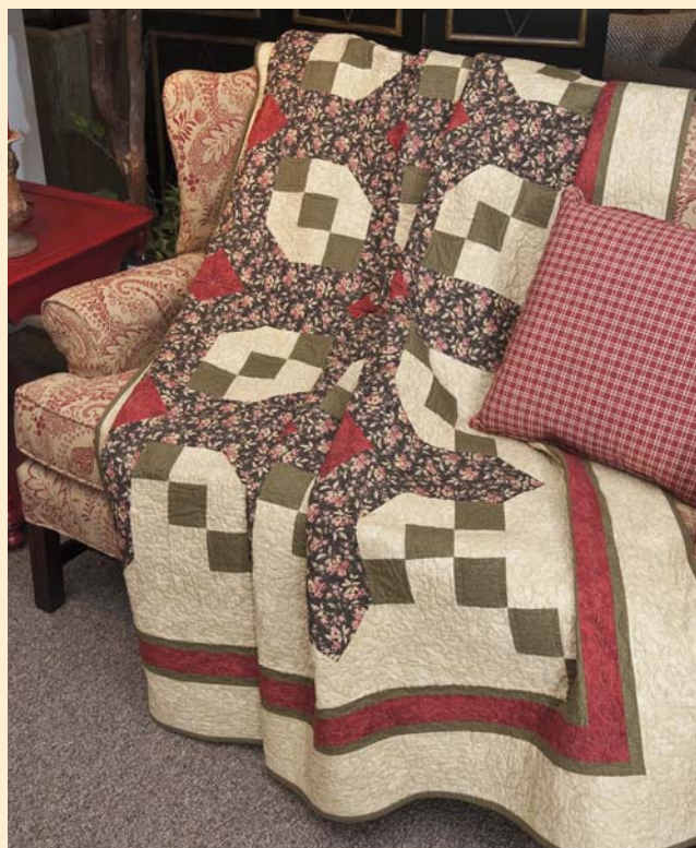
WAY TO GO!