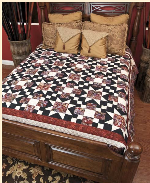
STARS AT SEA