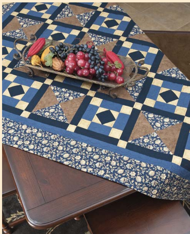
KISSES AND HUGS (TO SUSIE!)