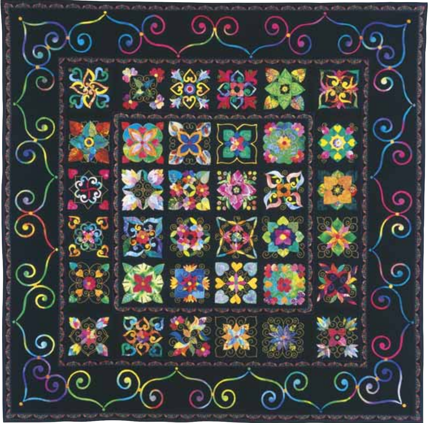
AFFAIRS OF THE HEART, 62" x 62", made by the author