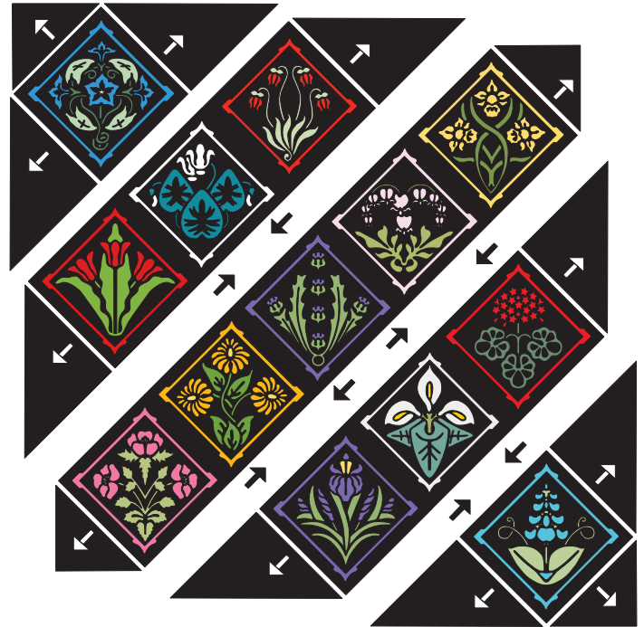
Figure 4. Arrows indicate direction for seam to be pressed.

Sew the appliquéd ivy rectangle to the top of the quilt. Press the seam toward the rectangle. (Figure 5)